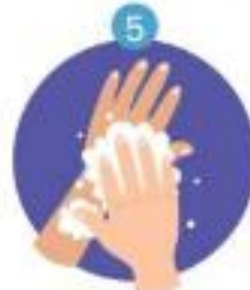
BACK OF HANDS