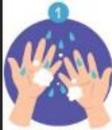
WATER AND SOAP