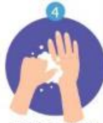
FOCUS ON THUMBS